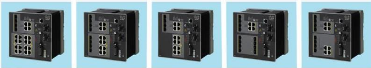
Figure 1. IE 4000 models

Figure 1 shows the switch models, Table 2 lists all the available Cisco IE 4000 Series models, Table 3 lists the power supplies for Cisco IE 4000 Series Switches.