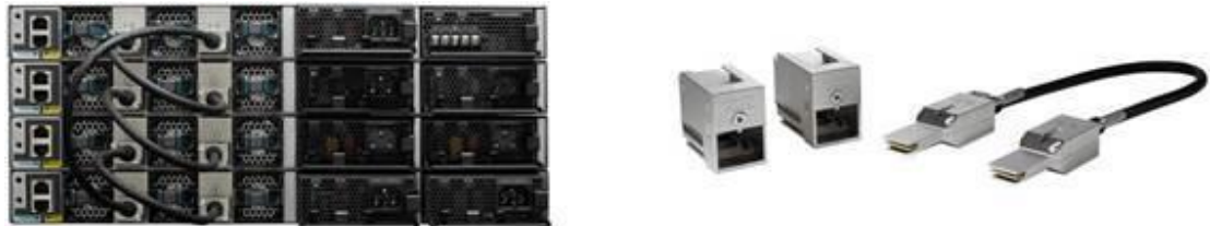
Figure 3. StackWise-160 Kit with Stack Adapters and Cables

highly resilient single unified system of up to nine switches, providing simplified management using a single IP address, single Telnet session, single CLI, auto-version checking, auto-upgrading, auto-configuration, and more. StackWise-160 also enables local switching in Cisco Catalyst 3650 Series Switches.