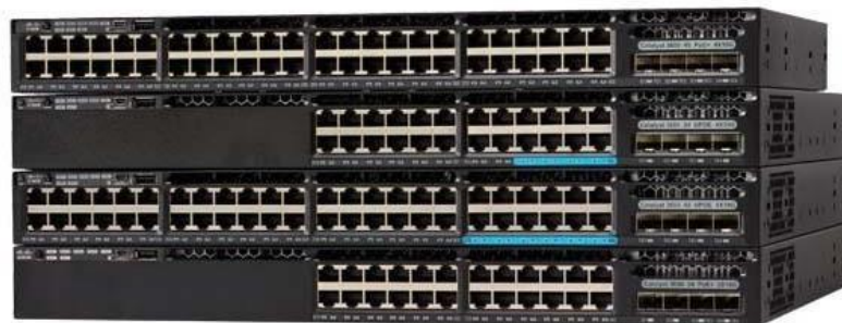
Figure 1. Cisco Catalyst 3650 Series Switch