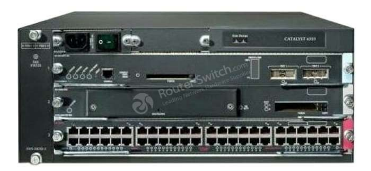
Table 1 shows the Quick Spec of 6503-E.

Figure 1 shows the appearance of the WS-C6503-E with modules. These modules must be purchased separately.