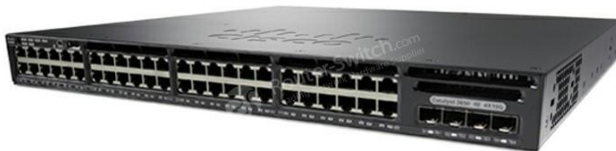
Figure 1 shows the front view of WS-C3650-48TQ-S.