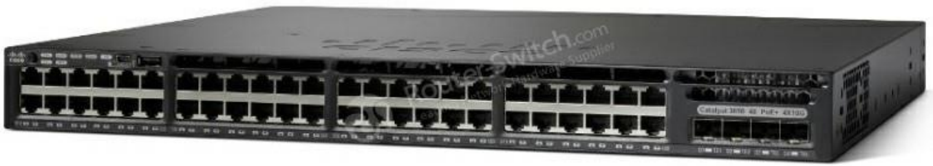
Figure 2 shows the front view of WS-C3650-48PQ-S.