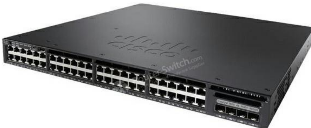
Figure 1 shows the front view of WS-C3650-48FWQ-S.