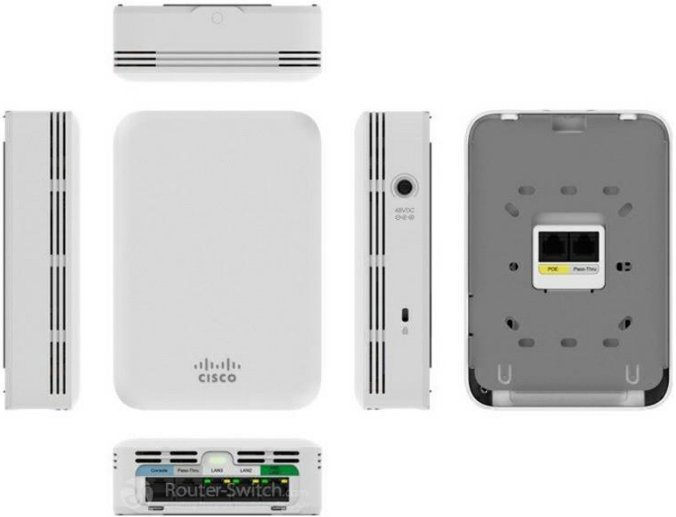
Figure 2 shows the face and left side of AP.