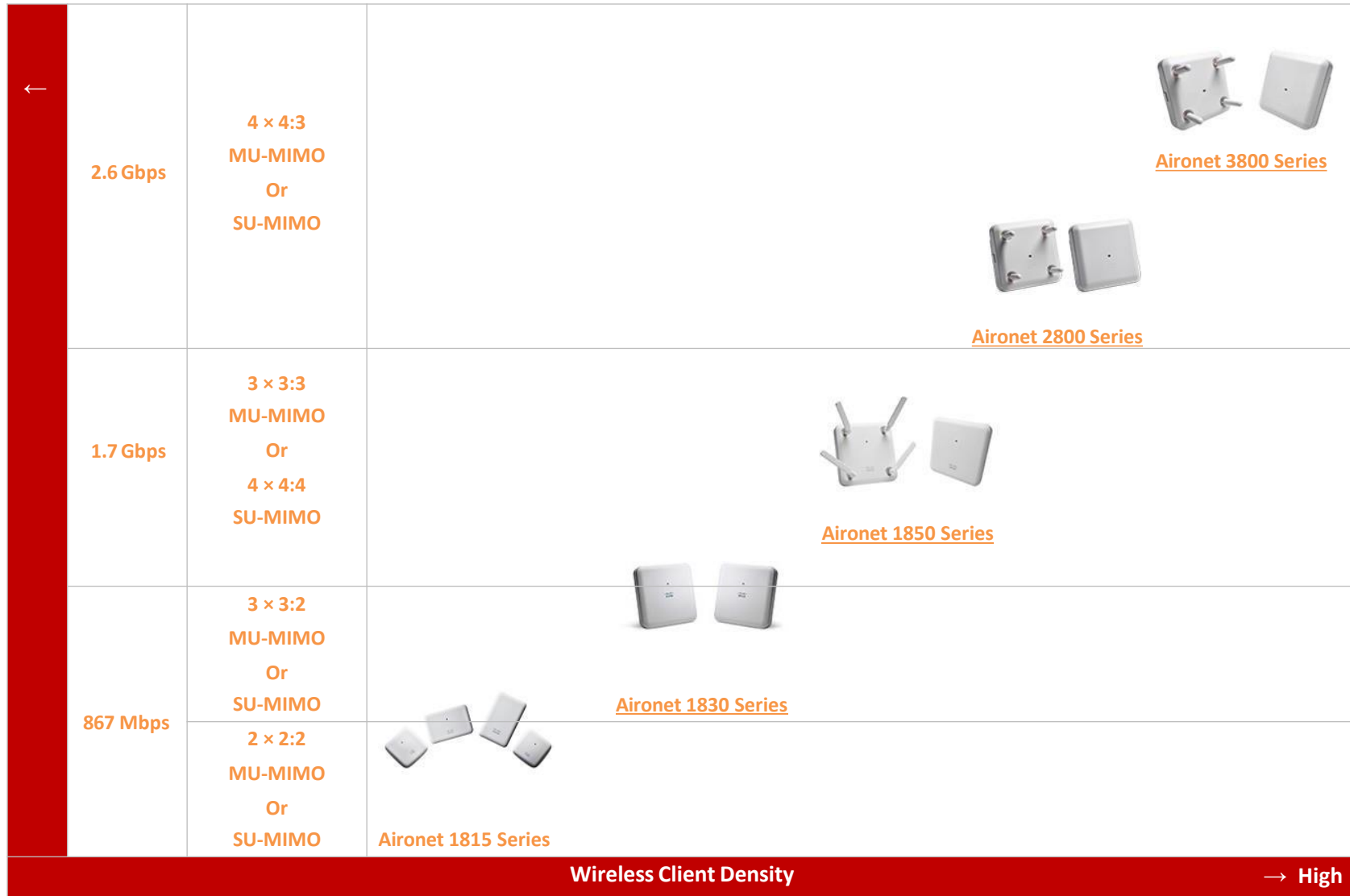
Table 1. Cisco Aironet Access Points-positioning map