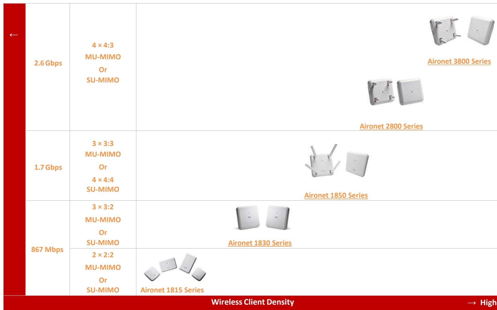
Table 1. Cisco Aironet Access Points-positioning map