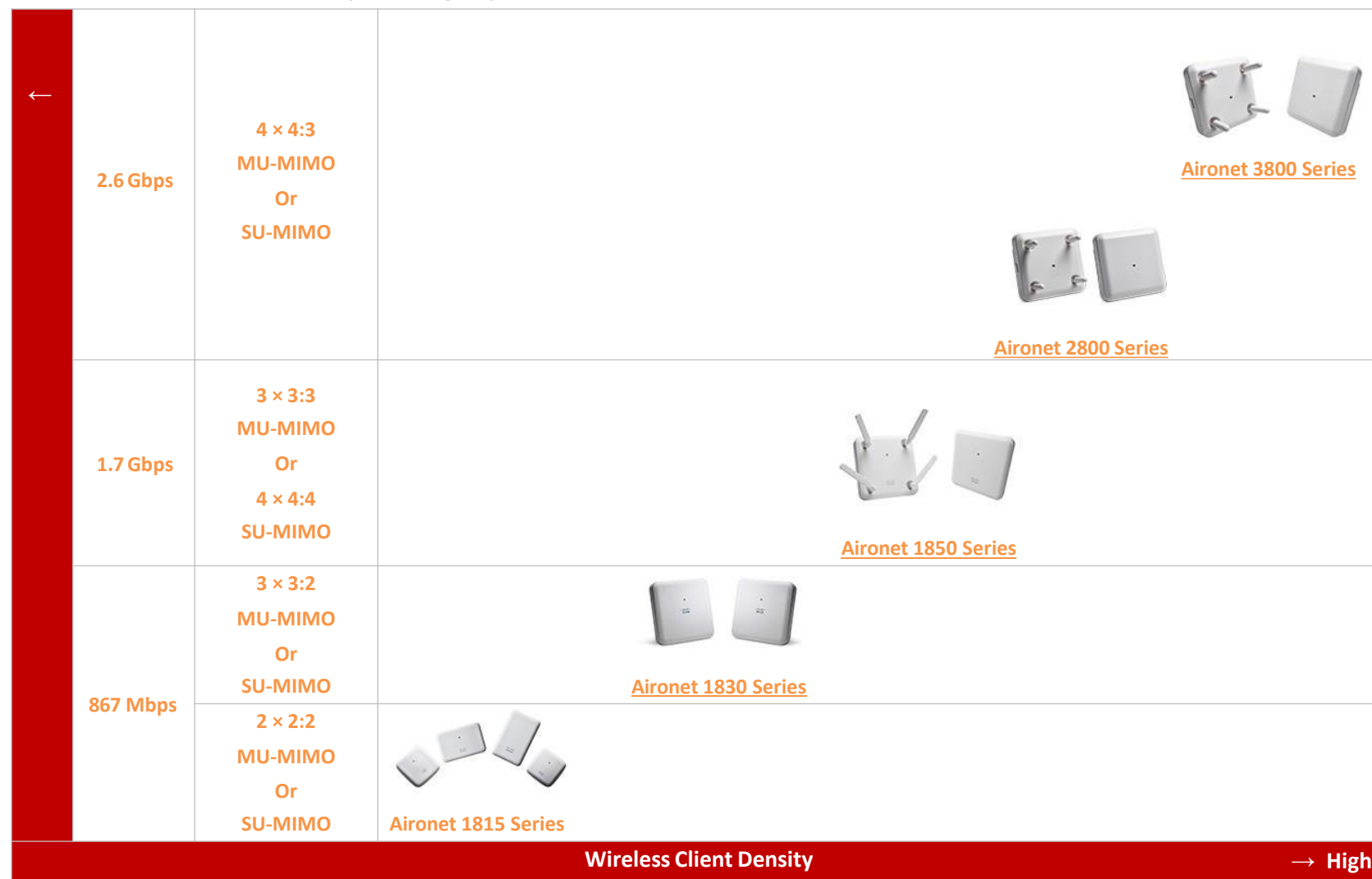
Table 1. Cisco Aironet Access Points-positioning map