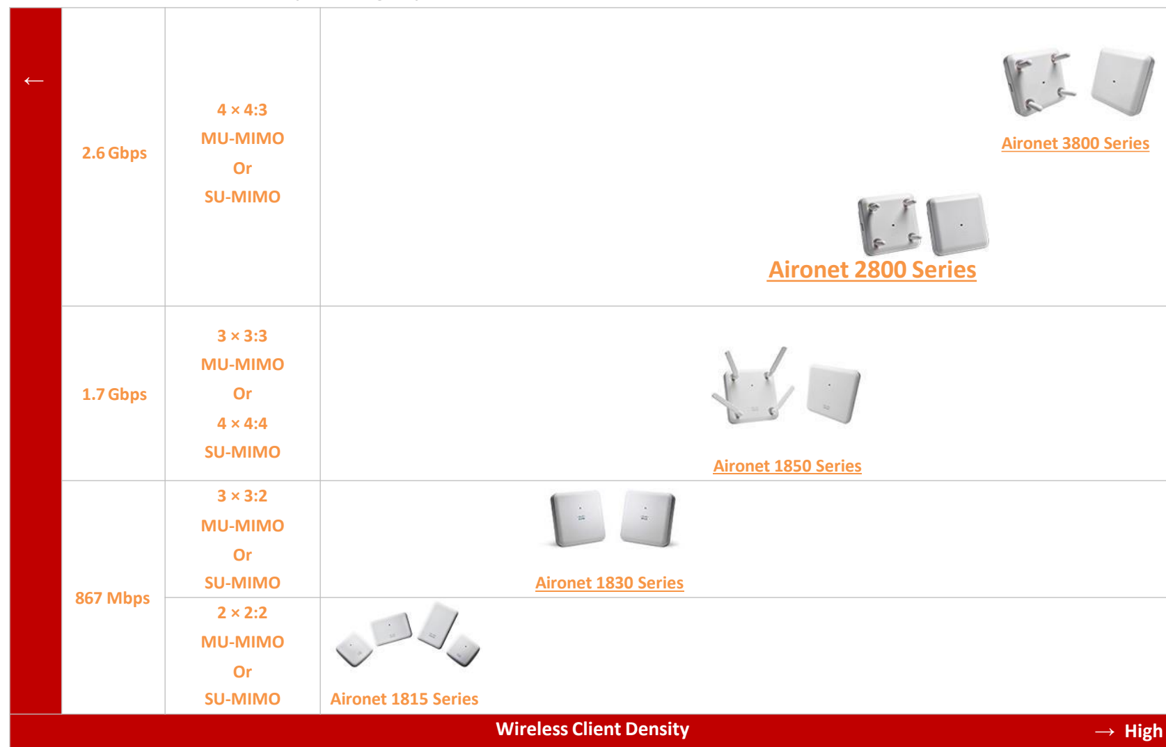
Table 1. Cisco Aironet Access Points-positioning map