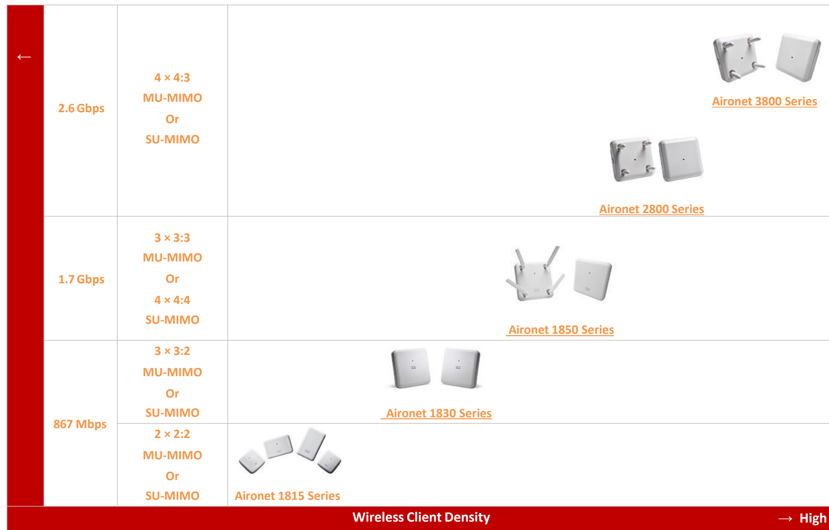
Table 1. Cisco Aironet Access Points-positioning map