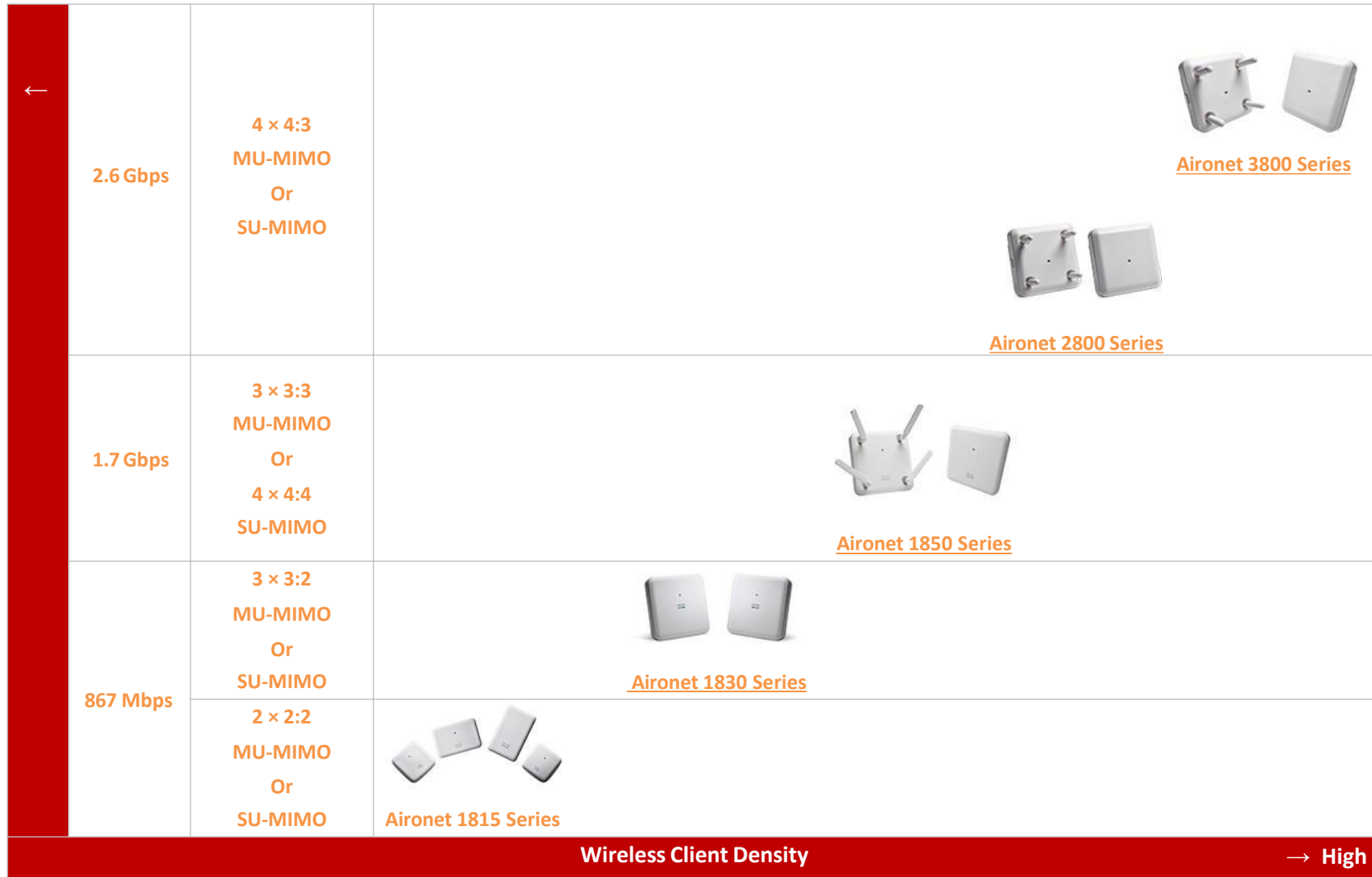
Table 1. Cisco Aironet Access Points-positioning map