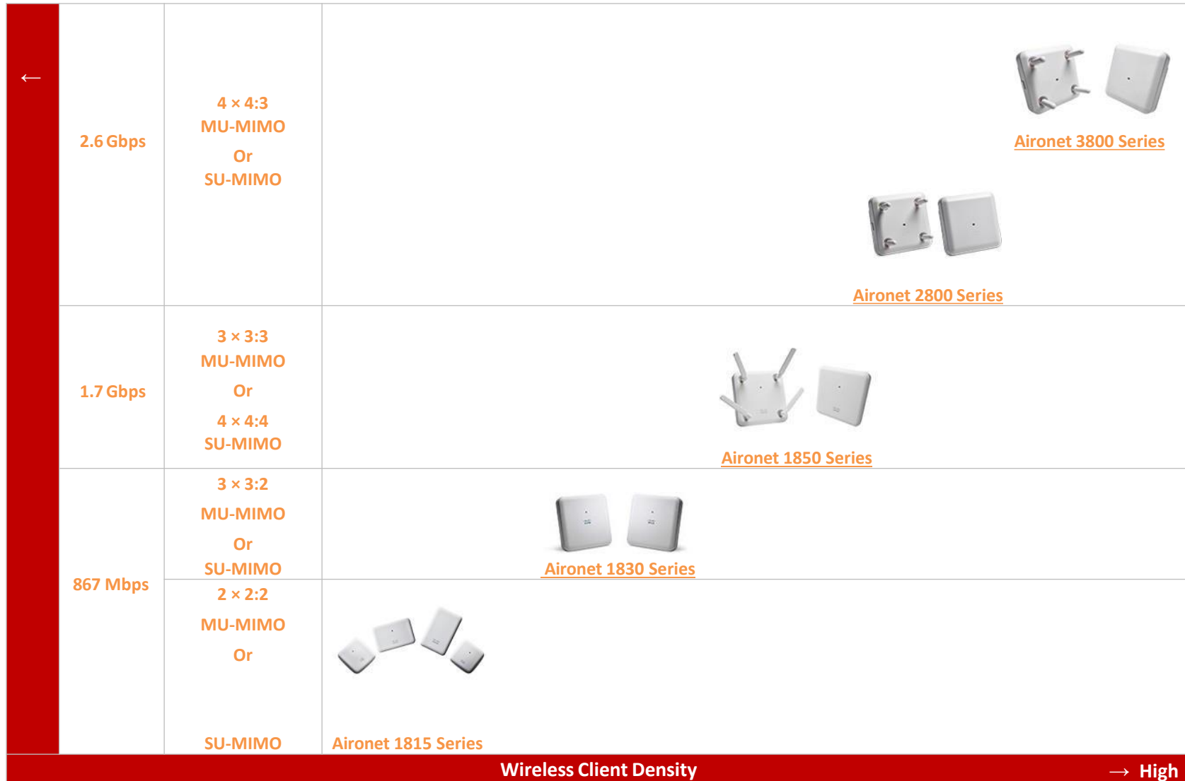
Table 1. Cisco Aironet Access Points-positioning map