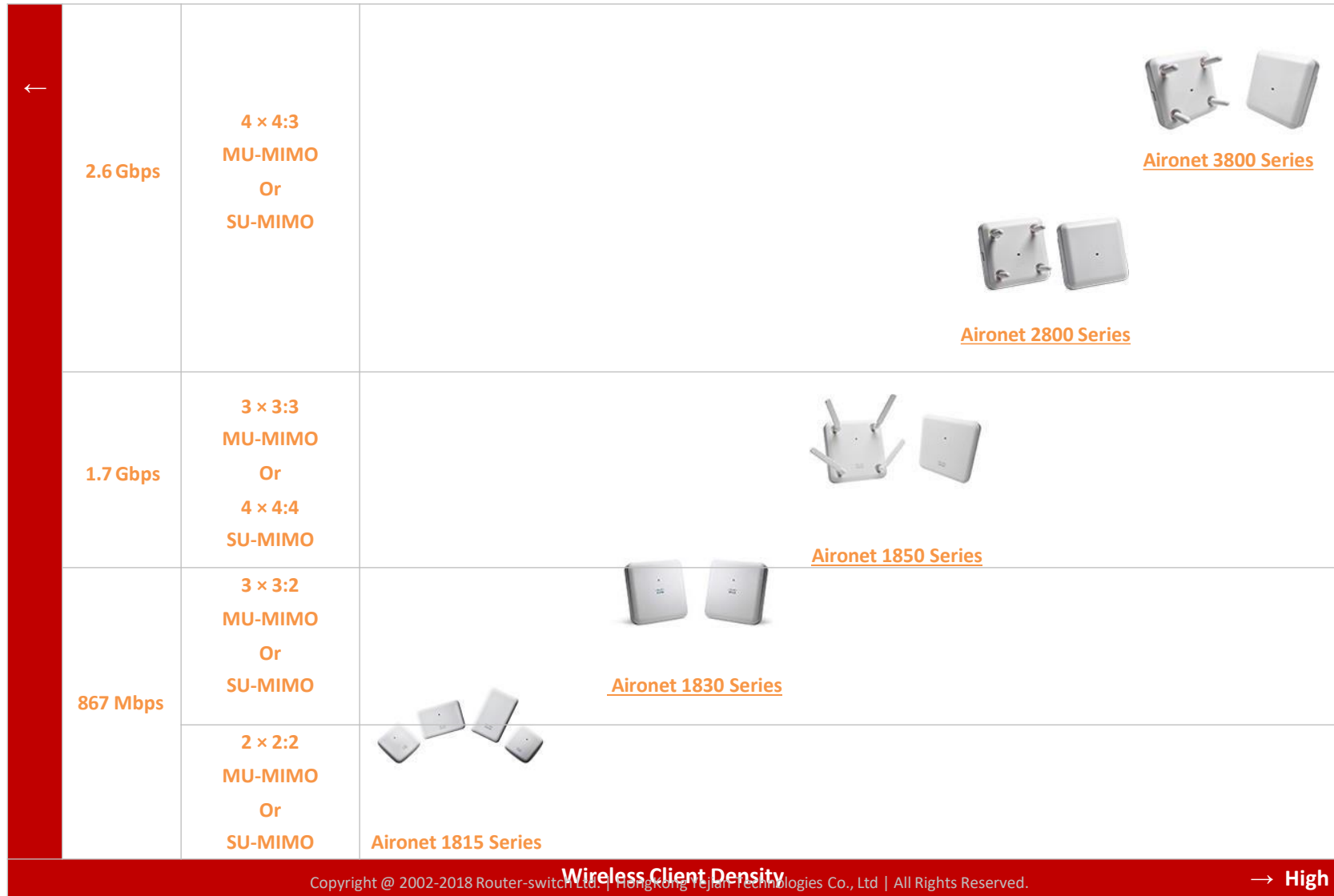
Table 1. Cisco Aironet Access Points-positioning map