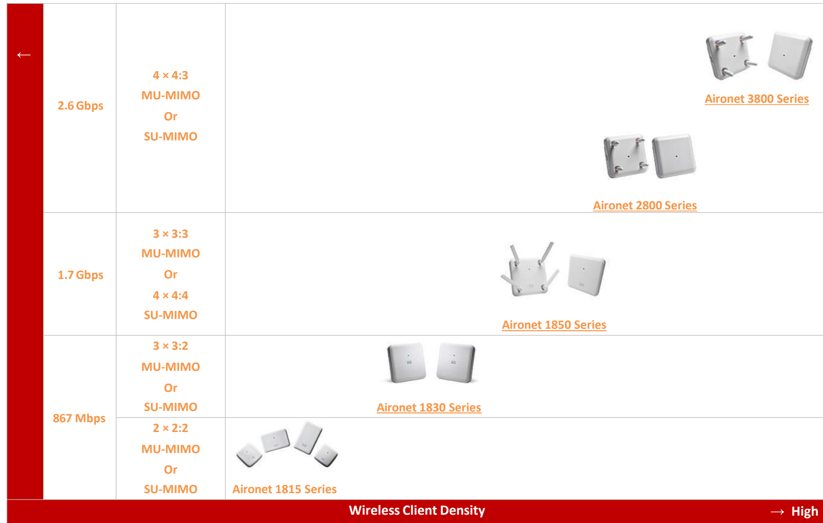
Table 1. Cisco Aironet Access Points-positioning map