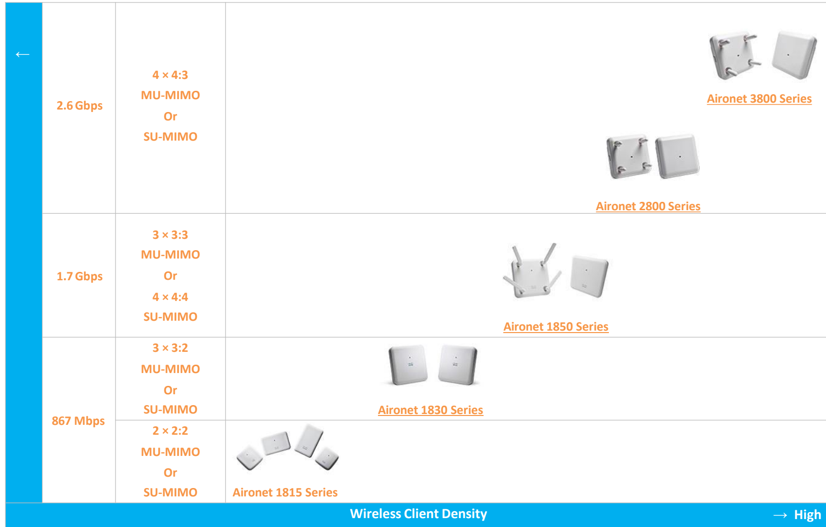
Table 1. Cisco Aironet Access Points-positioning map