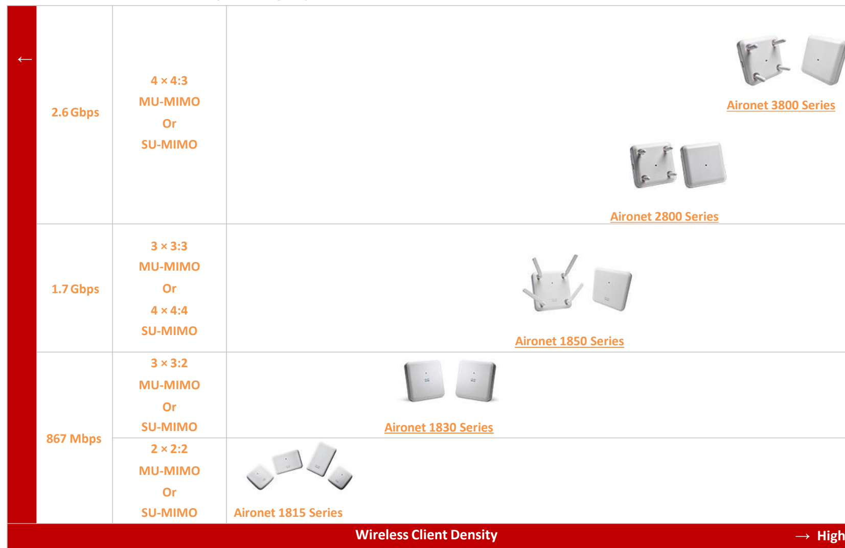
Table 1. Cisco Aironet Access Points-positioning map