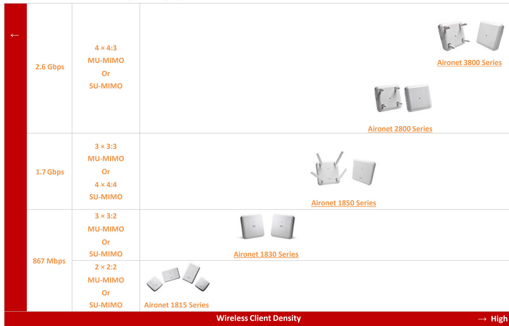
Table 1. Cisco Aironet Access Points-positioning map