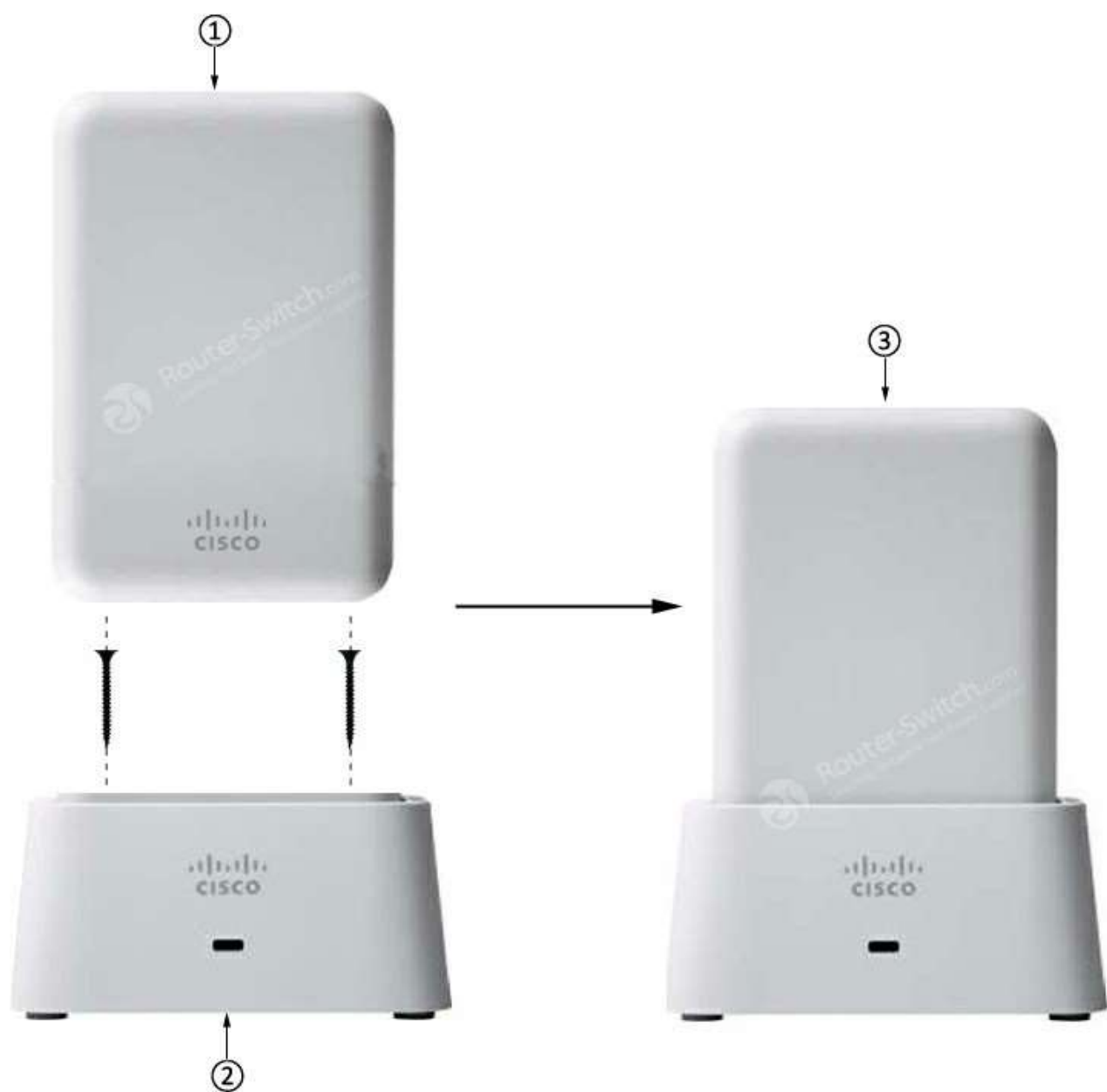
Figure 3. Mounting the AP in the Cradle.

·PSE / LAN port 1 provides 802.3af/at Power Sourcing Equipment (PSE) PoE-Out power on the LAN 1 Ethernet interface. With 802.3at input the PoE-Out is 6.95W (Class 2).With DC input the PoE-Out is 12.95W (Class 0).