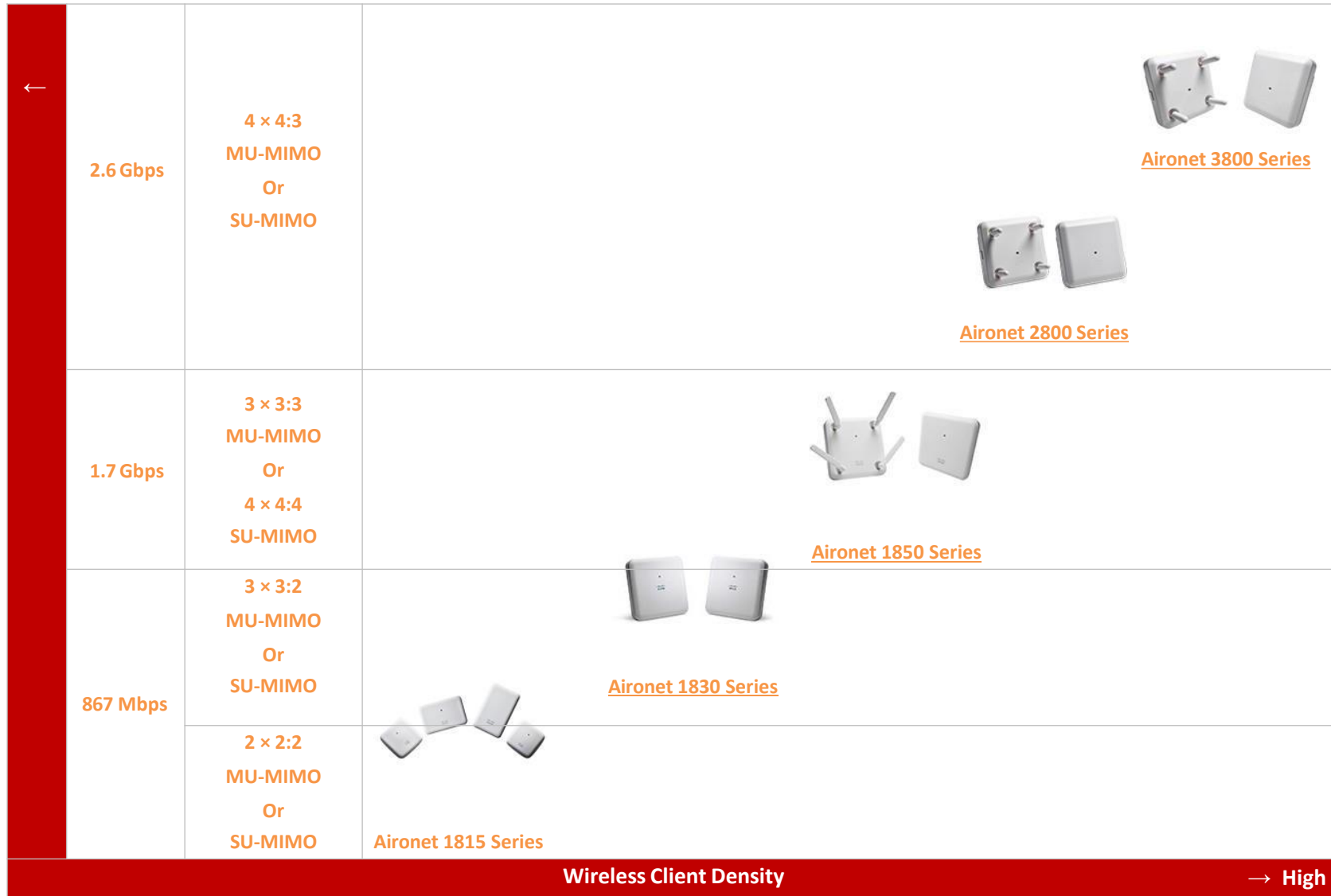
Table 1. Cisco Aironet Access Points-positioning map