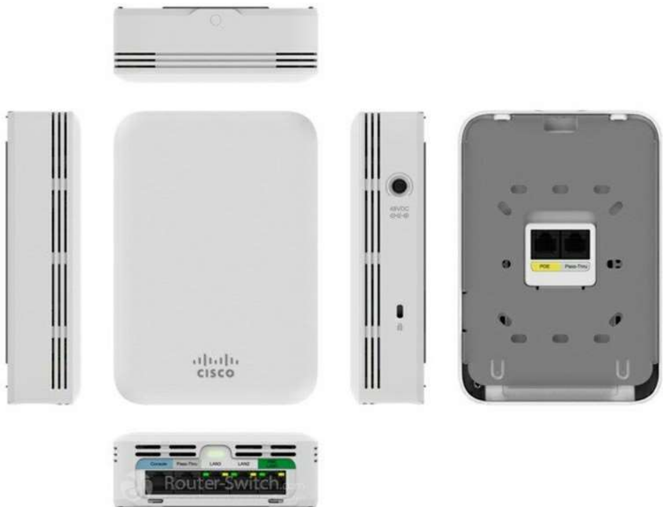
Figure 2 shows the face and left side of AP.